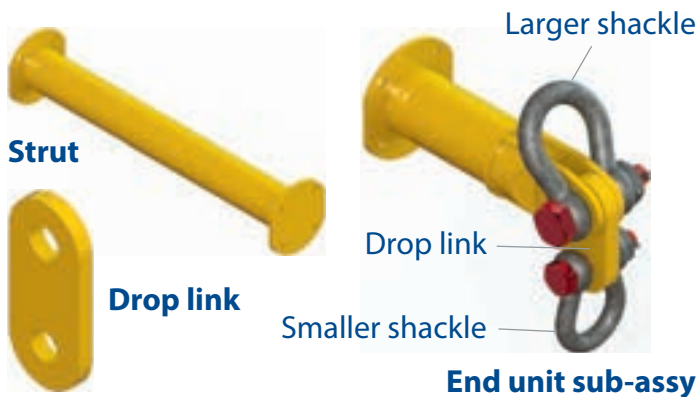
Table 1 – Component List