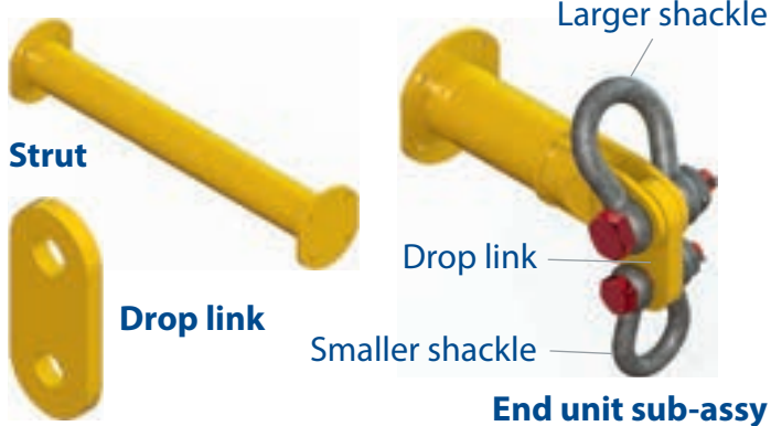
Table 1 – Component List